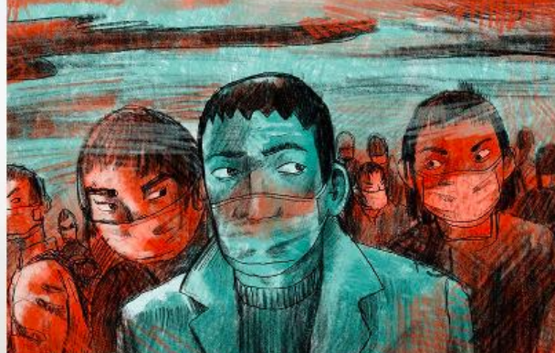
Figure 2. Blog entry images